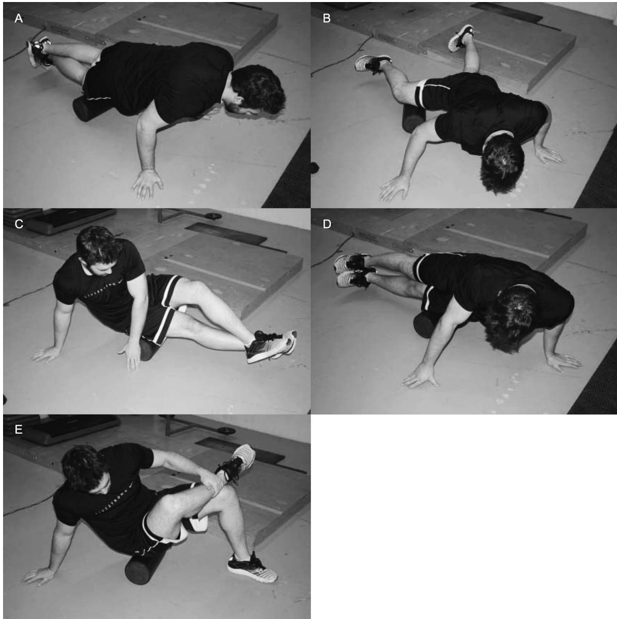
Figure 3. A participant demonstrates the 5 muscle groups foam rolled and the technique used for each muscle group. Foam rolling consisted of 45 seconds of rolling for each muscle in the left lower extremity, 15 seconds of rest, 45 seconds on the right lower extremity, and 15 seconds of rest for all muscles in the following order: A, quadriceps, B, adductors, C, hamstrings, D, iliotibial band, and E, gluteals. Total foam-rolling time was 20 minutes (15 minutes of rolling and 5 minutes of rest).

nondominant foot. Lights were set at a height of 0.4 m above the ground. Participants were instructed to start and encouraged to give maximal effort when they were ready. Time started when they crossed the first gate and ended when they crossed the same gate at the end of the test. The faster of the 2 trials was used for analysis.