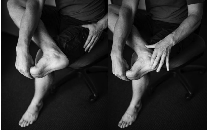
Fig. 1. Plantar-specific stretching was performed with the patient crossing the affected leg over the contra lateral leg. While placing the fingers across the base of the toes, the patient pulled the toes back toward the shin until they felt a stretch in the arch or plantar fascia. The patients were instructed to use their other hand to palpate the tension in the plantar fascia to confirm the stretch.