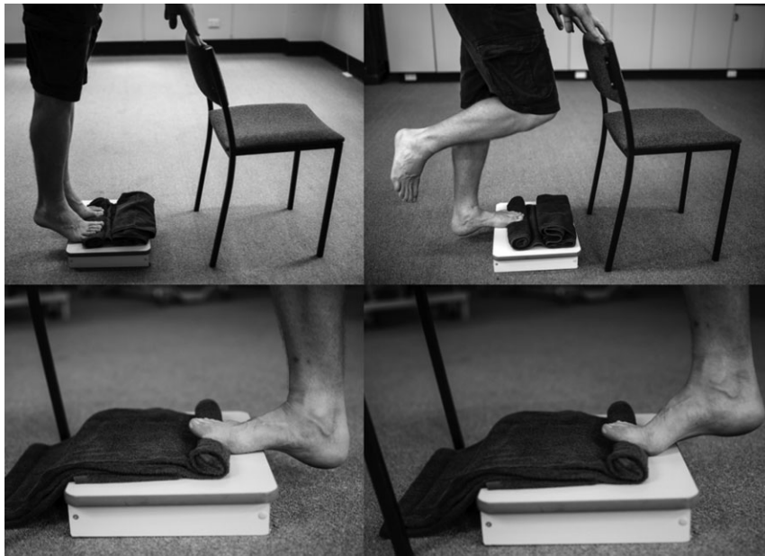
Fig. 2. Unilateral heel raises were performed with a towel under the toes to increase dorsal flexion of the toes during heel raises.

bilateral pain, they were instructed to perform the high-load strength training with both limbs.